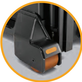
MPC 3040 with NT Mast

Larger load wheels offer longer life and are designed for easy access and replacement.